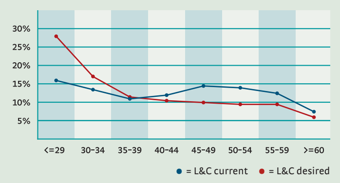
Desired age distribution of Language & Culture staff plotted against existing distribution (2006)

Based on a total cost price per FTE of academic staff of EUR 130,000 per annum (source: VSNU) the amount required will be: EUR 84.5 M per annum.